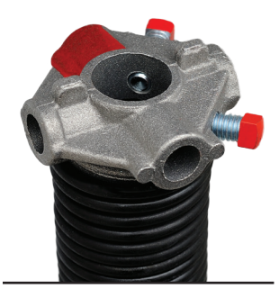
SPRINGS Torsion springs are helically wound with stress relieved, oil-tempered wire